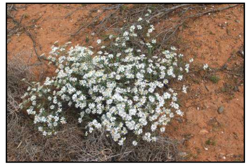
[By A LOVE OF THE OUTBACK]

"The wind is in the barley-grass, The wattles are in boom; The breezes greet us as they pass With honey sweet perfume; The parakeets go screaming by With flash of golden wing, And from the swamp the wild-ducks cry Their long-drawn note of revelry, Rejoicing at the Spring."